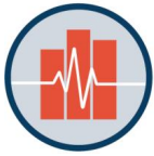
FIGURE 2: FACILITY CLAIMS PROCESS, INPATIENT